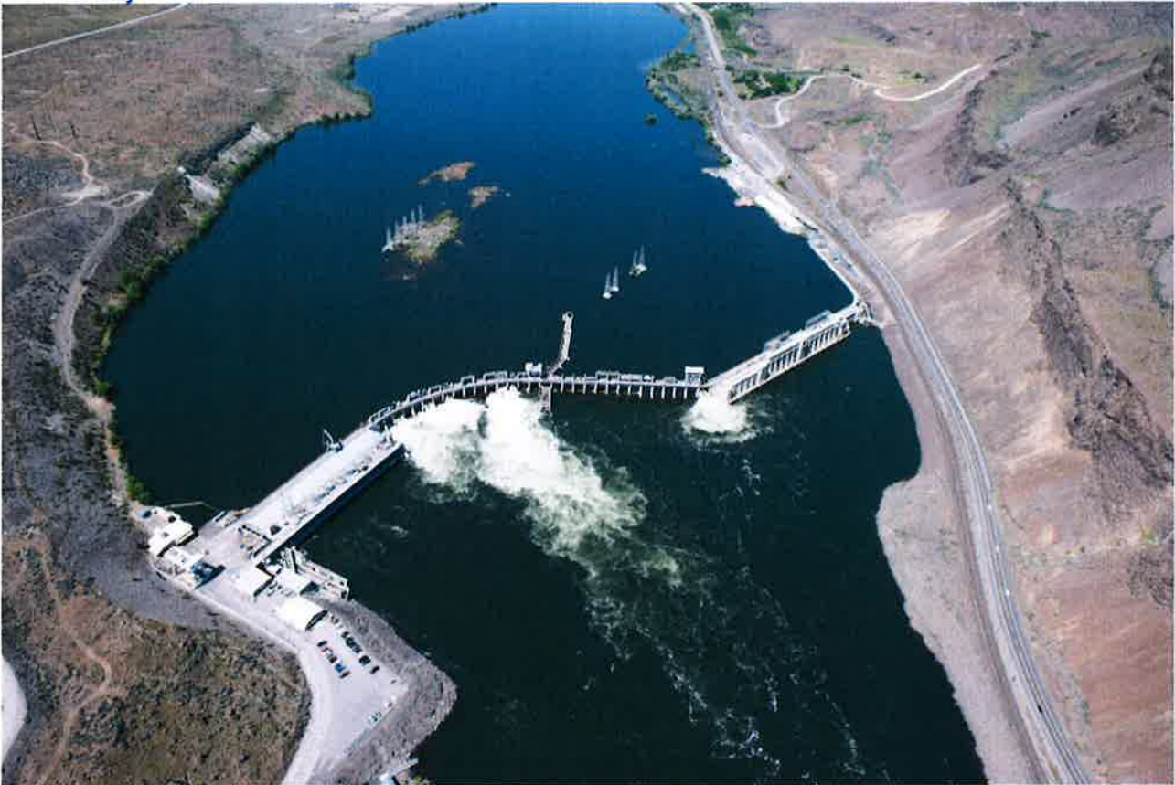
Exhibit C – Project Site Aerial