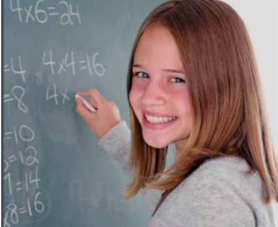
OSPI School Construction Assistance Program Overview

(A) OSPI releases funding commitments for qualifying projects once a year - after July 1st (concurrent with the start of the state's fiscal year). Projects may be "front funded" or "non-front funded." Front funded projects may begin construction prior to the state funding release. Districts using front funding must certify to OSPI that they have adequate funding to pay for the entire project in advance of receiving state monies. For non-front funded projects, school districts start construction following the state announcement that the district has secured funding.