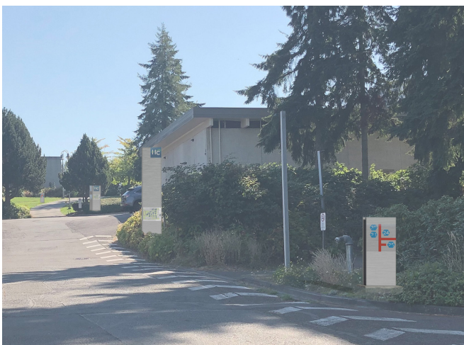
Existing condition of campus wayfinding