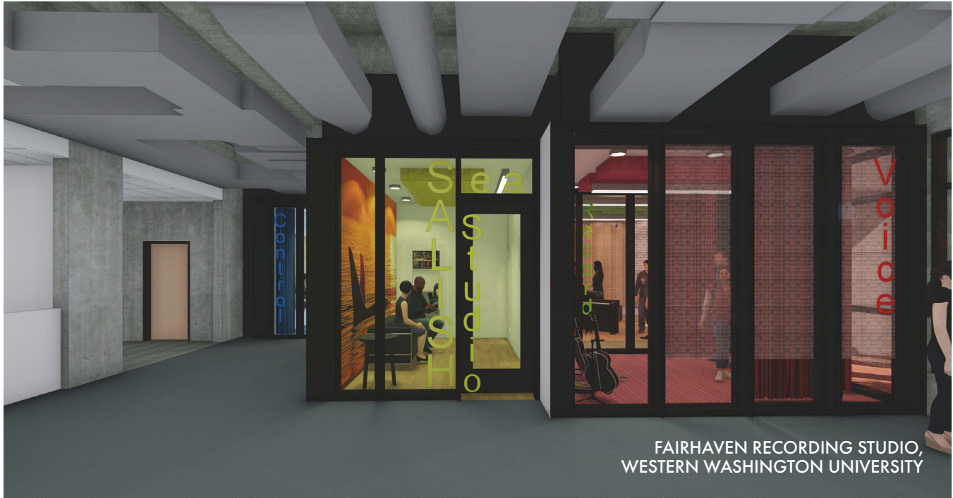
FAIRHAVEN RECORDING STUDIO, WESTERN WASHINGTON UNIVERSITY

Architecture is about the balance of program, function, beauty, and aesthetics within the reality of structure, utility (MEP), and budget/cost. Beauty without function or vice versa is not architecture. Architecture for Everyone idealizes this balance and prides itself on taking all aspects into consideration when designing, regardless of the scale of the project. Small and unassuming projects deserve attention and care the same as larger and more prominent projects. In the end, architecture serves the well-being of the end users and those who interact with it. Beauty comes from the satisfaction of serving our clients and end users well, and the physical outcome that lifts the human spirit. Architecture for Everyone will bring this mindset to projects for the Seattle Colleges and will apply the following approach.