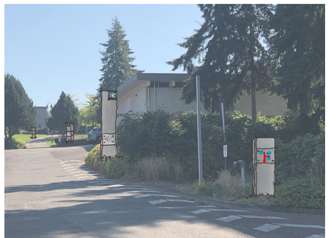
Freehand sketches of vertically oriented directional signage