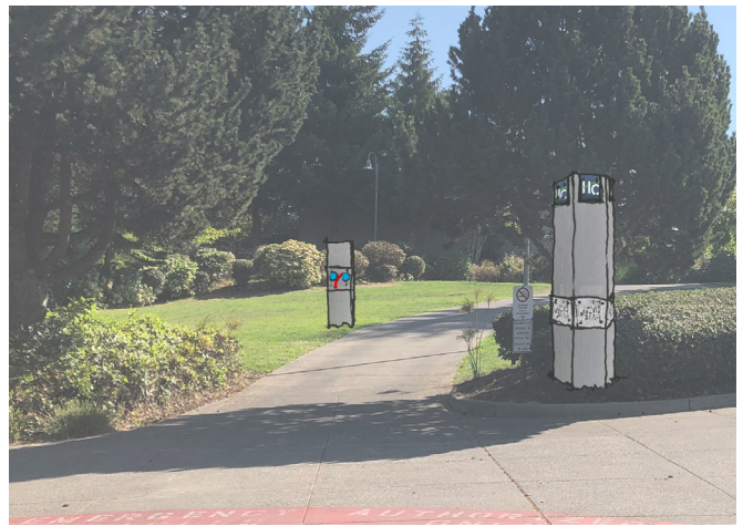
Ko used freehand sketches to demonstrate how vertically oriented directional signage would effectively aid in wayfinding on the horizontally oriented campus