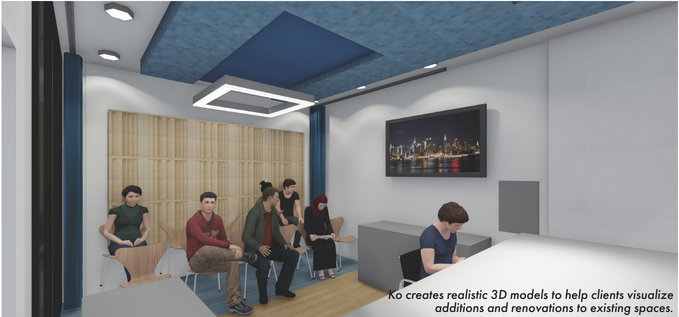
Ko creates realistic 3D models to help clients visualize additions and renovations to existing spaces.