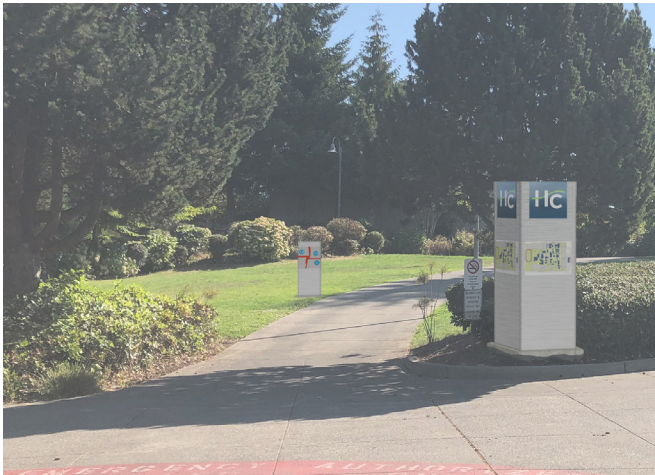
Existing condition of campus wayfinding

Scope and budget alignment Effective stakeholder communication Design and construction efficiency maximization Schedule management for on-time completion