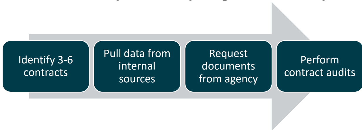
Figure 1. Phase 2: DES contract audit preparation