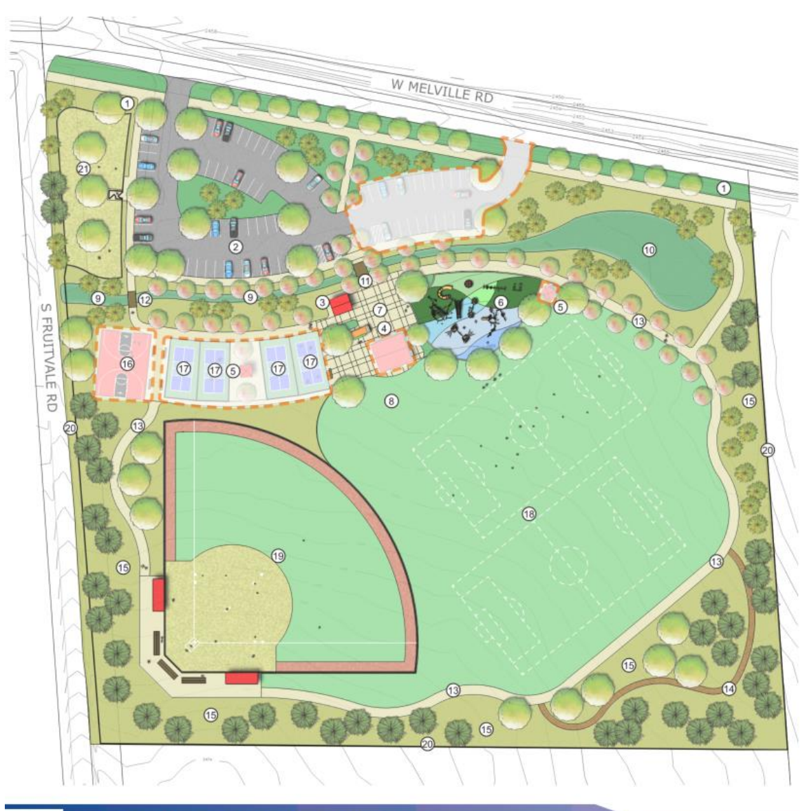
Exhibit D – Concept Plans