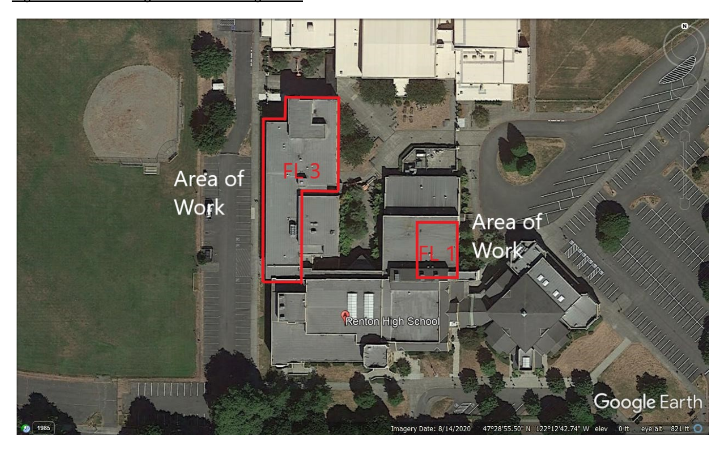
Figure 3 – Renton High School Building Aerial