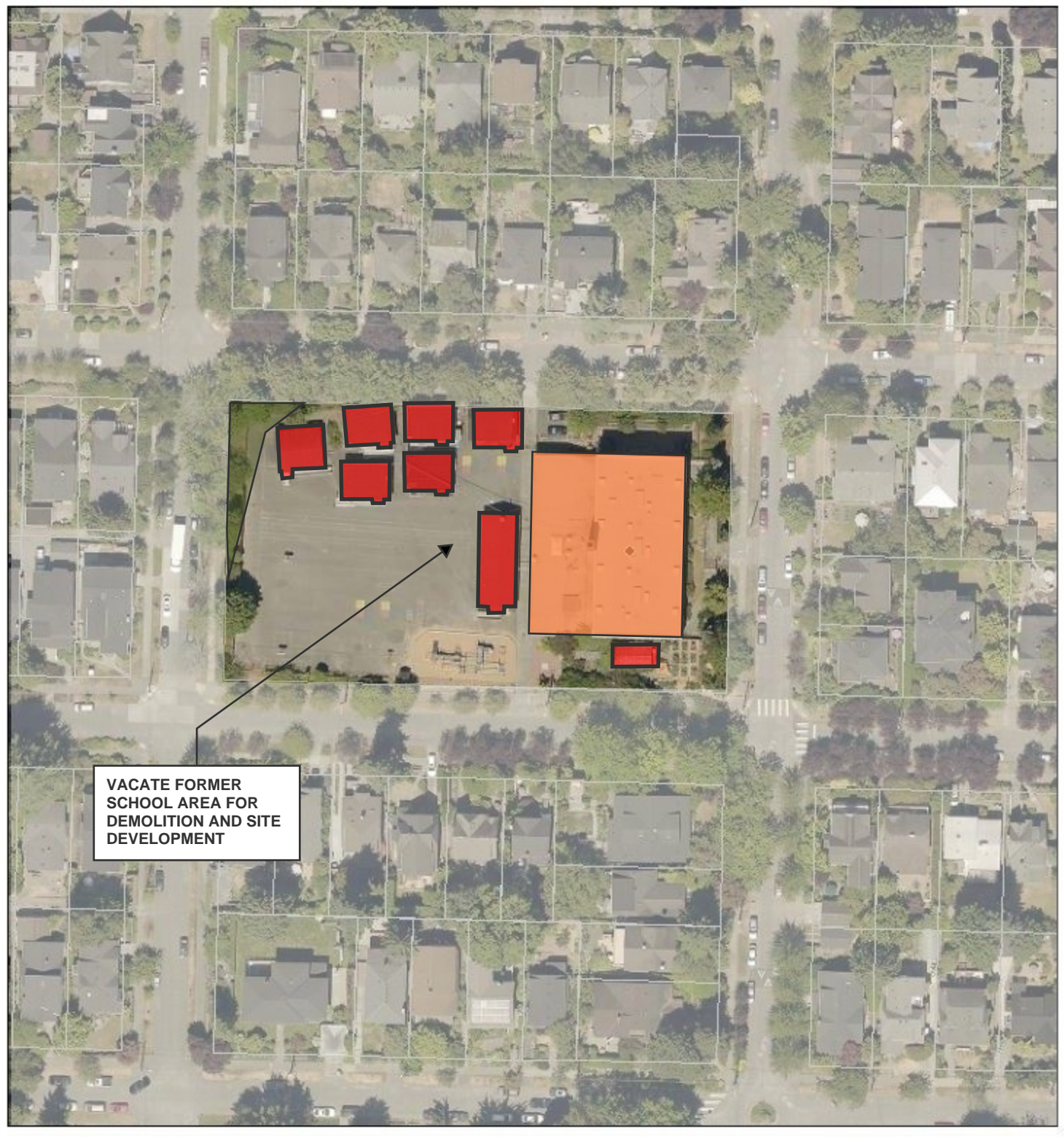
MONTLAKE ELEMENTARY SCHOOL | DEMOLITION DIAGRAM