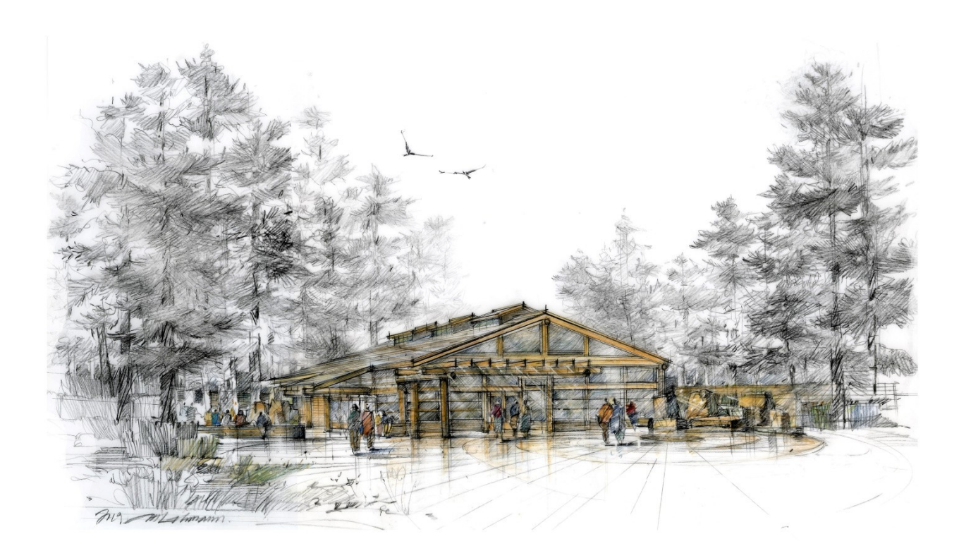
Figure 1: Architect's rendering of the Coast Salish Longhouse

Western's proposed longhouse will stand as a landmark for Native people, validating Western's commitment to addressing diversity, equity and inclusion.