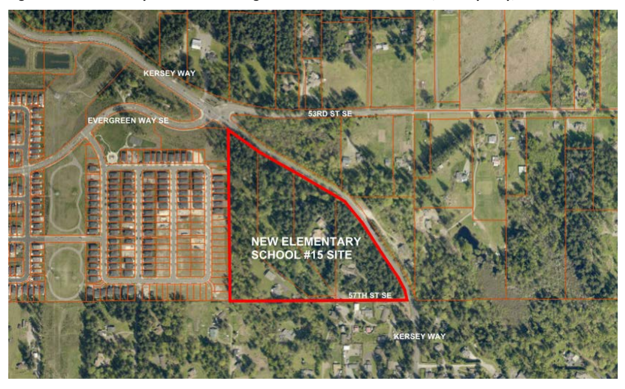
Figure 1.1 – Elementary School No.15 Neighborhood Aerial - 57<sup>th</sup> St. SE / Kersey Way, Auburn WA