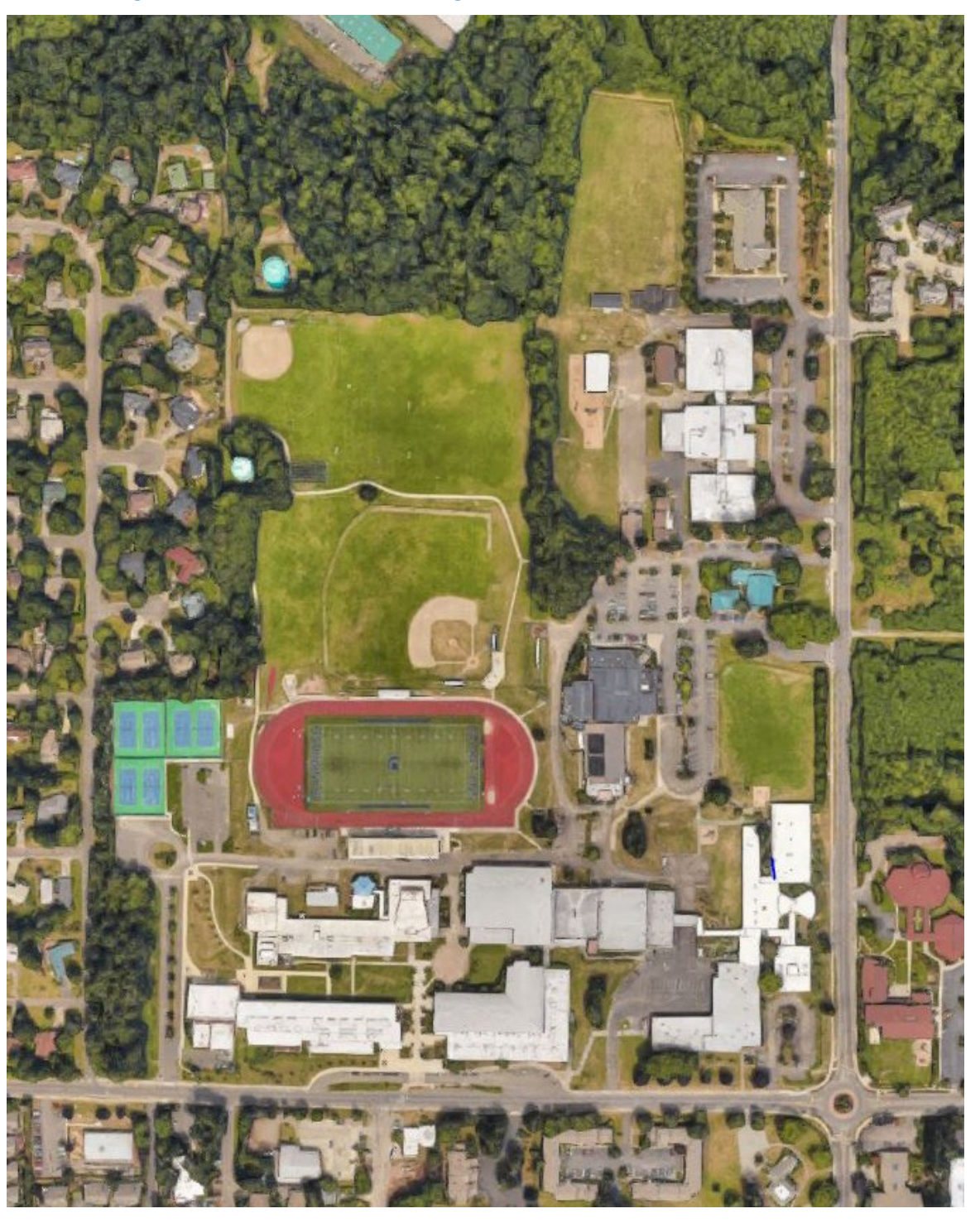
Figure 1 – Existing BHS Site & Overall Surroundings