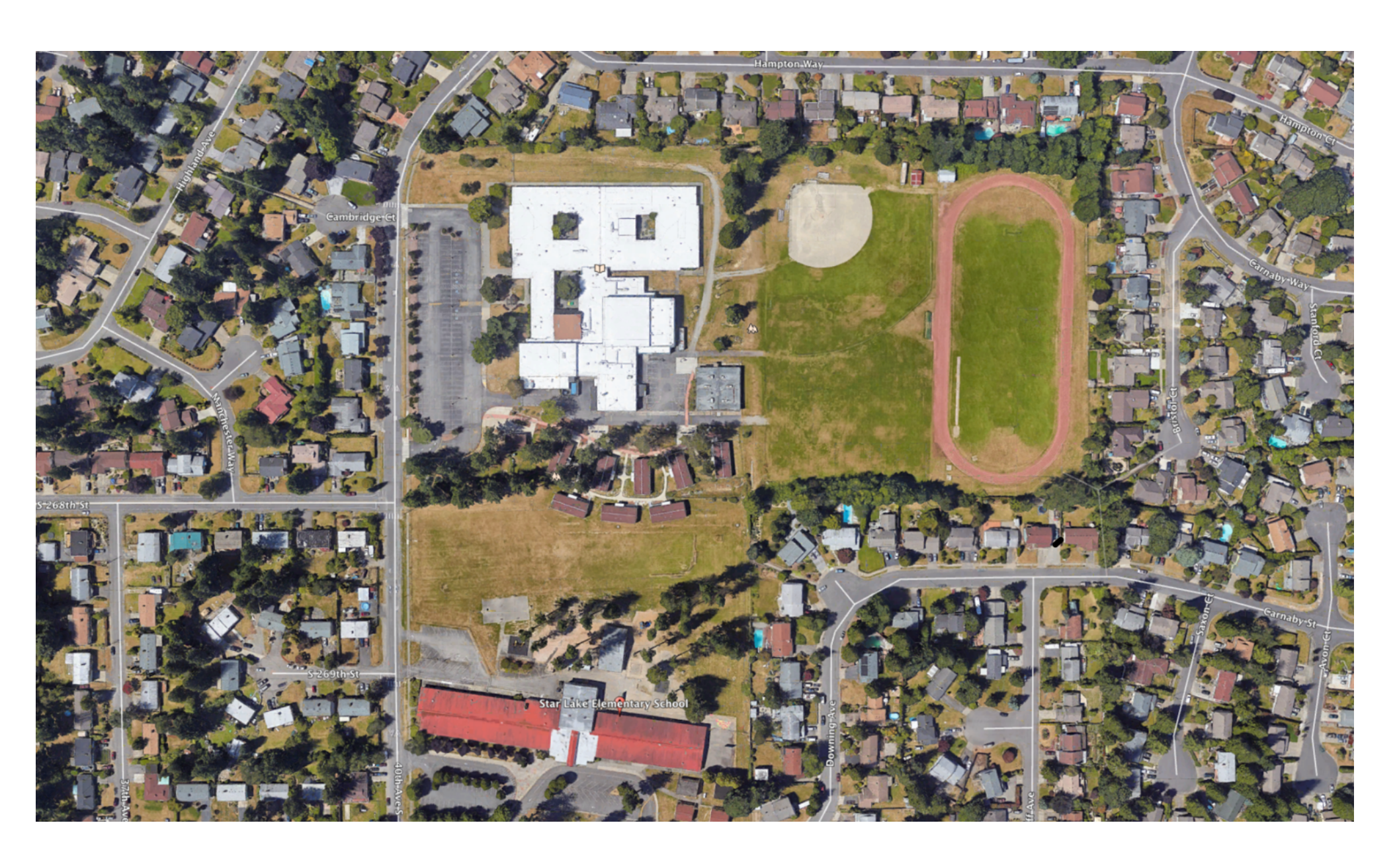
Exhibit E Star Lake and Totem Middle School Project Site