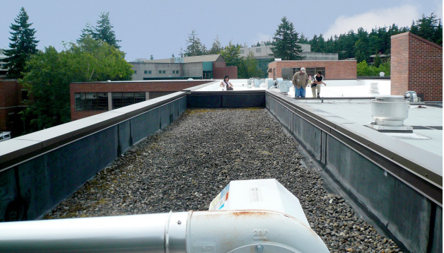
WWU FINE ARTS BUILDING | ROOF REPLACEMENT