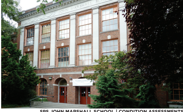
SPS JOHN MARSHALL SCHOOL | CONDITION ASSESSMENTS