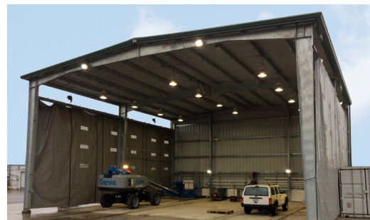
KCSW CAT SHACK REPLACEMENT