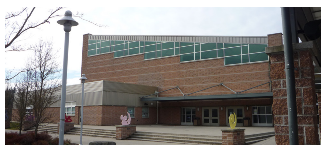
EDMONDS SD MOUNTLAKE TERRACE ES | IT IMPROVEMENTS