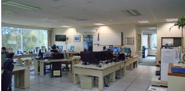
NOAA WRC | COMPUTER LAB ASSESSMENT