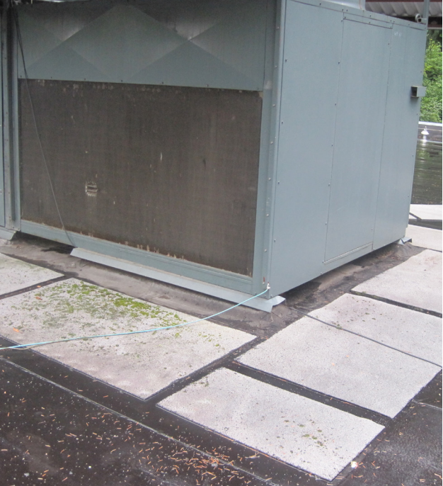
GREEN RIVER COLLEGE AD BUILDING | ROOFTOP HVAC UNIT