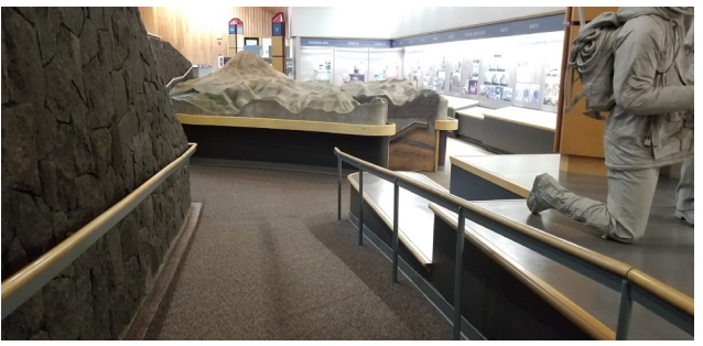
WASHINGTON STATE PARKS & RECREATION MOUNT SAINT HELENS VISITOR CENTER ADA ASSESSEMENTS AND IMPROVEMENTS