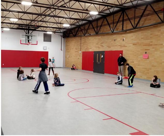
COUPEVILLE ELEMENTARY SCHOOL | MULTIPURPOSE BUILDING ADDITION