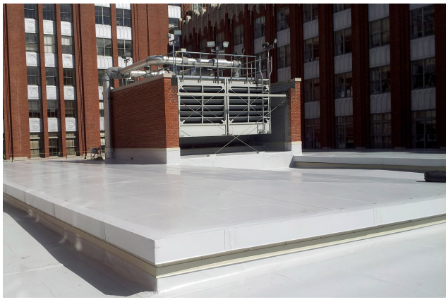
US GSA FEDERAL OFFICE BUILDING | ROOF REPLACEMENT