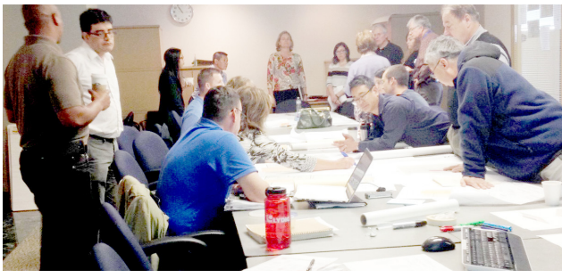
SEATTLE PUBLIC UTILITIES PROGRAMMING