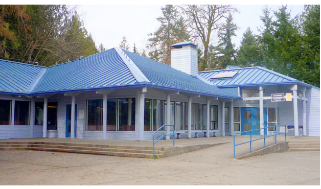
TESC HCC BUILDING | ROOF REPLACEMENT