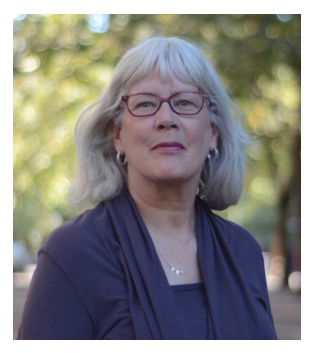
EDUCATION B.S. in Environmental Studies, University of Detroit. 1978

Bachelor of Architecture, University of Detroit, 1982