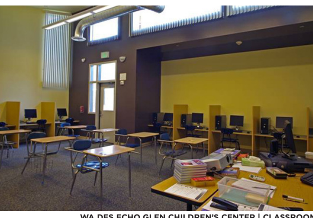
WA DES ECHO GLEN CHILDREN'S CENTER | CLASSROOM