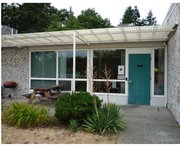
KCFAS WHITE CENTER PUBLIC HEALTH BUILDING | BUILDING ENVELOPE