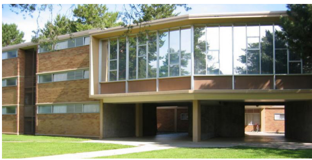
CWU STEPHENS-WHITNEY HALL | TENANT IMPROVEMENTS