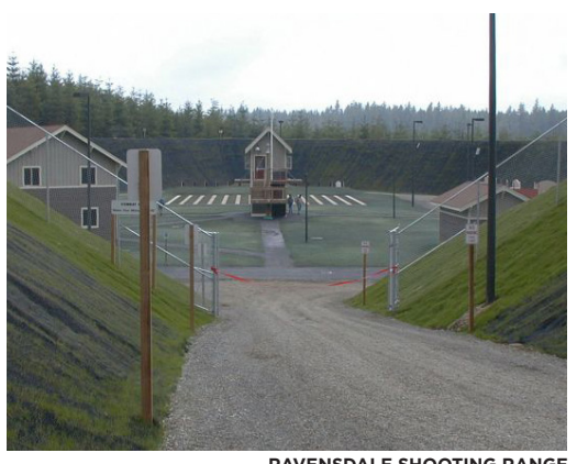
RAVENSDALE SHOOTING RANGE STRUCTURAL IMPROVEMENTS