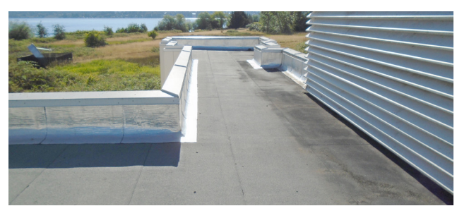
NOAA WRC | ROOF ASSESSMENT