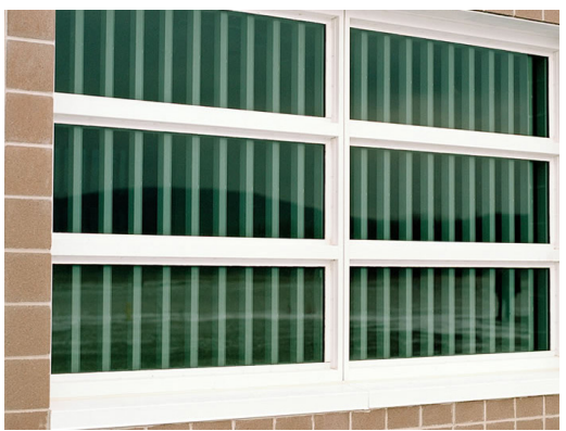
CORRECTIONAL FACILITY | WINDOW REPLACEMENTS