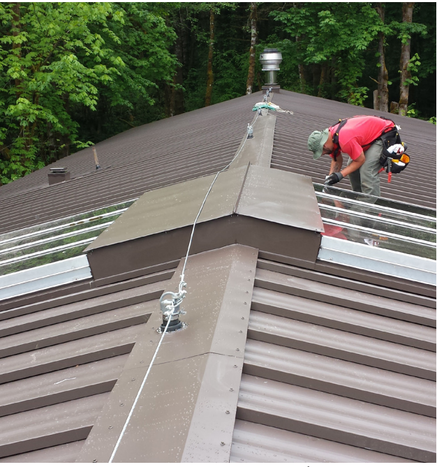
TESC LONG HOUSE | ROOF ASSESSMENTS