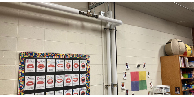
SEATTLE PUBLIC SCHOOLS NORTH BEACH ES | HVAC & FIRE SPRINKLERS