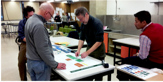
THE EVERGREEN STATE COLLEGE | PROGRAMMING SESSION