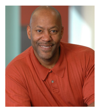
EDUCATION Master of Architecture, University of Washington,

Bachelor of Architecture, University of Washington, 1984