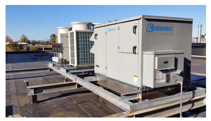
Mechanical Upgrades & Replacements, South Seattle College

Mechanical and electrical improvement projects, along with roof repairs and replacements, make up a significant percentage of our On-Call project portfolio. These projects often need the strongest project management because the budgets are slim and cannot afford escalation, scheduling is essential to minimize disruption in classrooms, and they uncover opportunities for unforeseen conditions to arise.