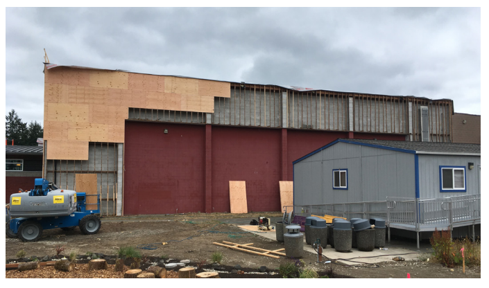
Envelope Improvements, Capital High School, Olympia School District

We have frequently addressed roofing and building envelope issues, power and IT failures, building facade failures, and notably, storm surge damage on a waterfront facility.