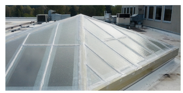
Skylight Replacements, Pierce College

We have technical knowledge and experience replacing, repairing, and assessing exterior wall assemblies to improve weather resistance and energy efficiency. Envelope work often occurs in an occupied structure, and we are experienced in working with clients and contractors to phase work and construct temporary barriers to protect and isolate users from construction.