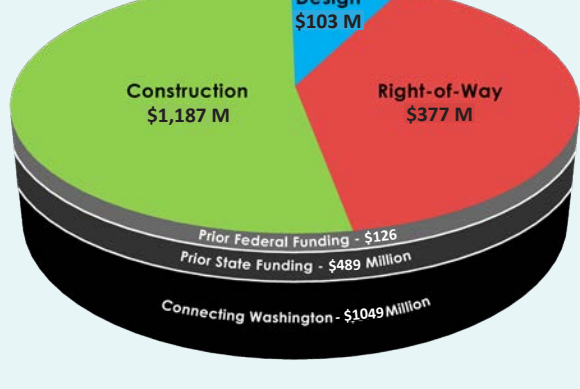
Estimated Total Cost: $1,666,000,000