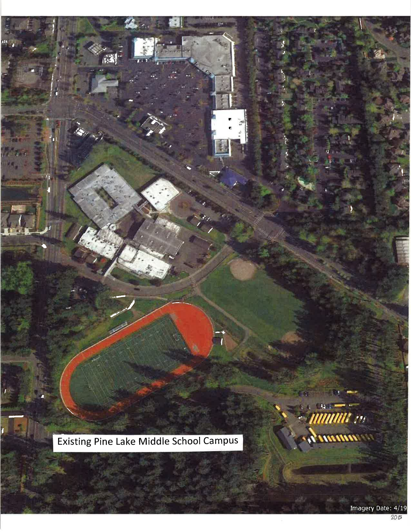
Existing Pine Lake Middle School Campus