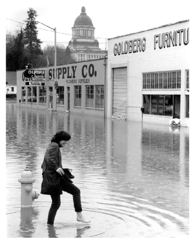
Flooding in Downtown Olympia, circa 1975

To understand the potential for flooding in downtown Olympia it is important to first