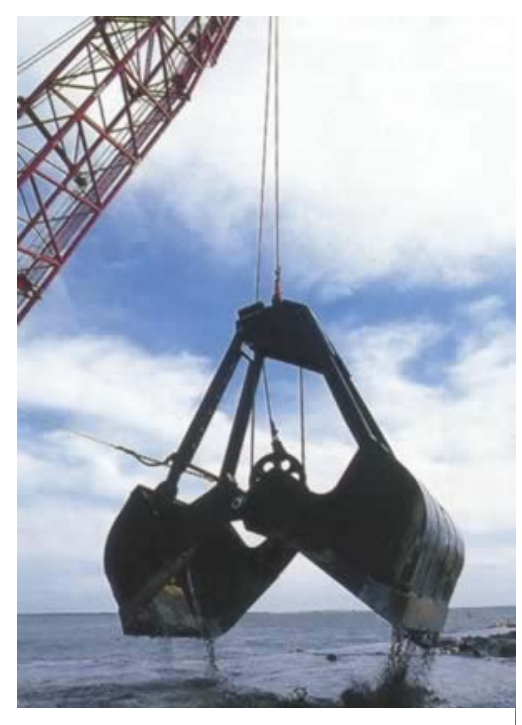
Open Water Dredging with Clamshell Crane

The long-term cost analysis presented for each alternative focuses on the direct project costs of infrastructure investments and long-term maintenance. In this case, long-term maintenance is primarily associated with dredging. An assessment of regional economic effects, such as those that might be associated with changes in tourism, participation in community events, or downtown business were not fully considered in the economic study due to the lack of readily available data. 149 There may also be other hidden or indirect costs, such as those associated with resource damage or liability, which also have not been addressed. All of the costs are provided as a range of low to high, to account for the fact that these are planning level cost estimates that cover a wide range of possibilities. The wide range in cost is primarily driven by assumptions associated with the type of dredge equipment used and how dredge material is disposed. All cost estimates are in 2008 dollars to simplify the comparisons.