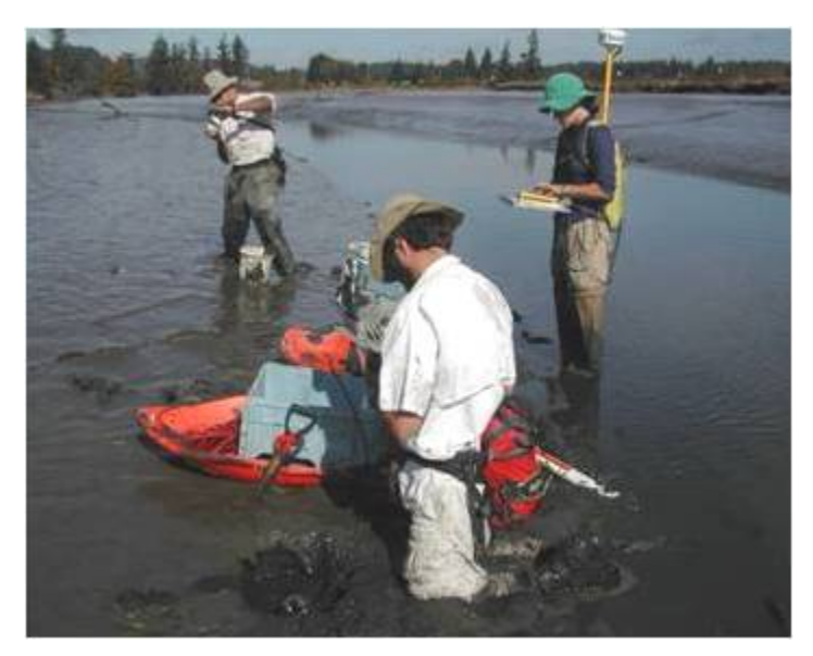
Sampling South Sound Estuaries

As a first step in developing a water quality improvement plan, Ecology performed a water quality study and developed a predictive model to evaluate point and nonpoint pollutant sources in the Deschutes watershed. All of the water quality issues described