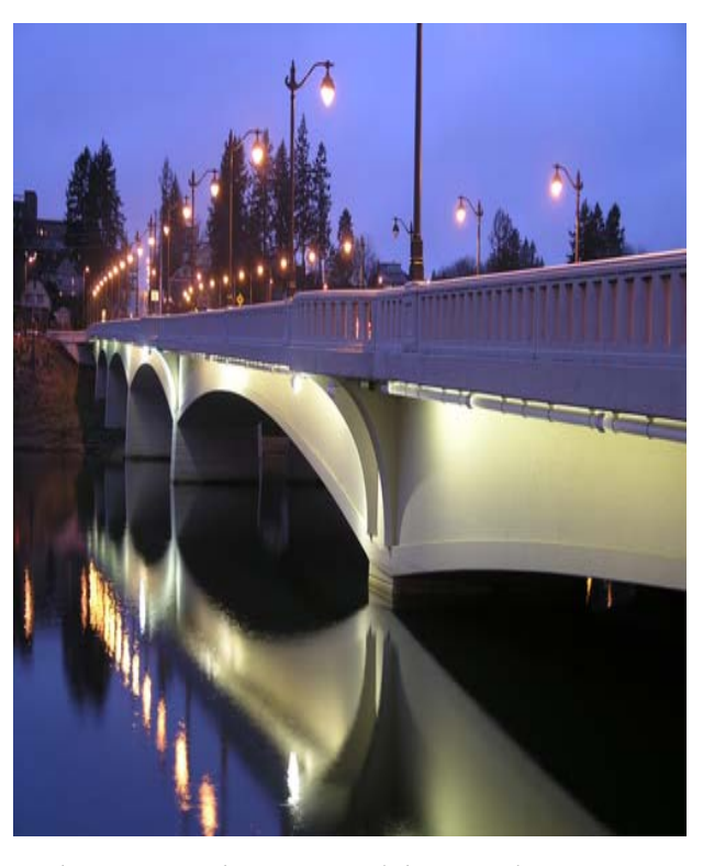
Olympia-Yashiro Friendship Bridge at 4th Avenue

This section addresses both the direct impacts (requiring upgrading or replacement) and indirect impacts (increasing vulnerability to flooding) of the alternatives. Impacts based on predictions of sea level rise are not addressed.