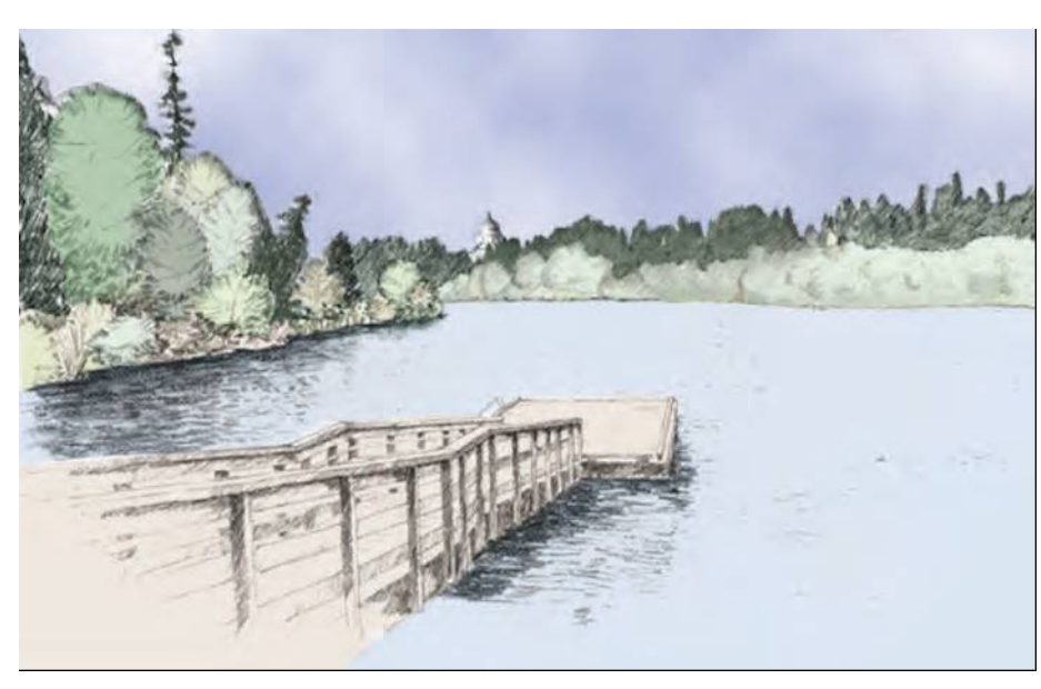
Artist's concept of Managed Lake Alternative

Under this alternative, ongoing CLAMP management actions would continue. These would include: