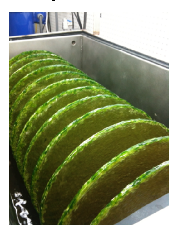
Figure 1 The Rotating Photobioreactor

nutrients are removed by vacuum collection, concentrated, and anaerobically digested to produce renewable energy or biofuel. The nitrogen and phosphorous are recovered from the digestate as inorganic nutrients such as struvite, ammonium bicarbonate solid crystals, or calcium phosphate (hydroxyapatite) and sold to organic farms that are in desperate need of certified organic fertilizers. (See attached publication "Opportunities Created by Engineered Solutions to the Capitol Lake / Budd Inlet 303 d Water Quality Dilemma" Burke, June 2016)